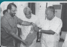
Speaker Sreeramakrishnan hands over an eco- friendly bag to Chief Minister Pinarayi Vijayan as part of Plastic-free Day observation organi- sated by the Suchitwa Mission at the for- mer's chamber in Thiruvananthapuram on Thursday. Former CM Oommen Chandy looks on.